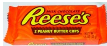
Reese's Peanut Butter Cups