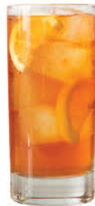
Unsweetened Iced Tea