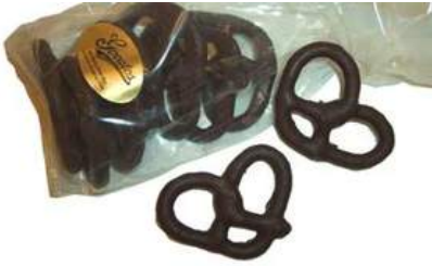
Dark Chocolate Covered Pretzels