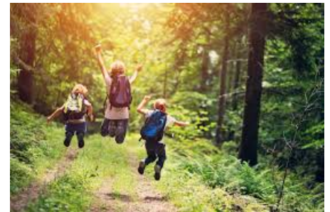
Travel and Exploring