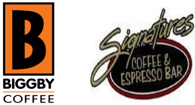
Biggby or Signatures