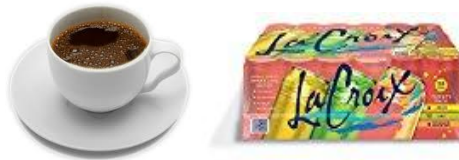
Caramel Latte or LaCroix