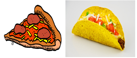
Pizza or Tacos